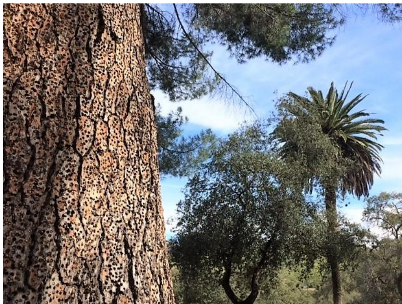
Larger look at Acorn Store plus scenery RB - I call it the pantry.