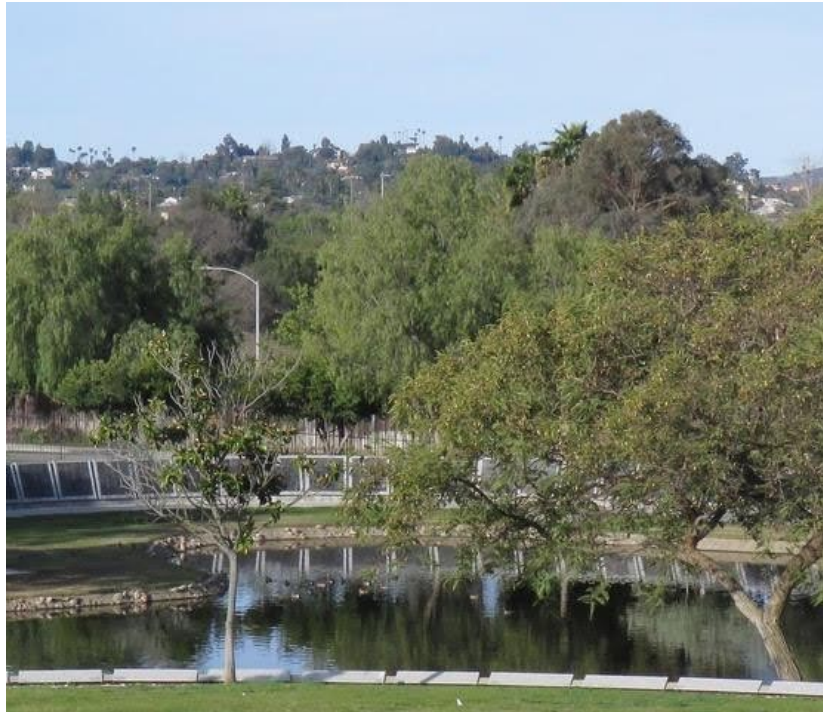
More of Oak Hill JC