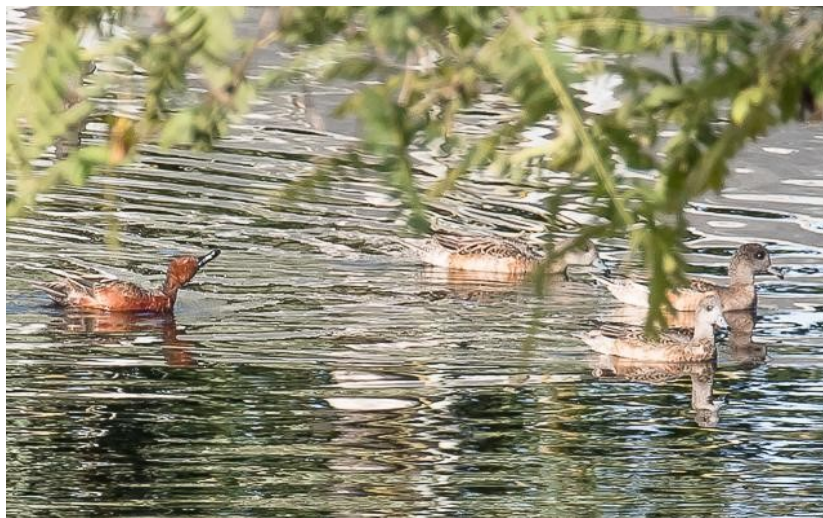
Cinnamon Teal and American Wigeons WS