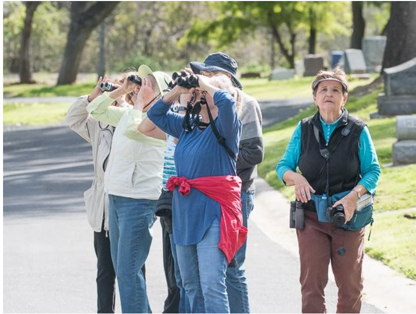
Part of the group