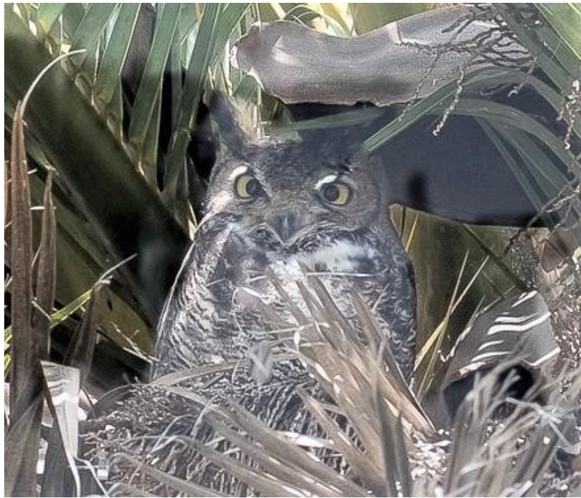
Great Horned Owl WS