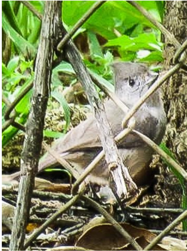
Very hard to photograph Oak Titmouse