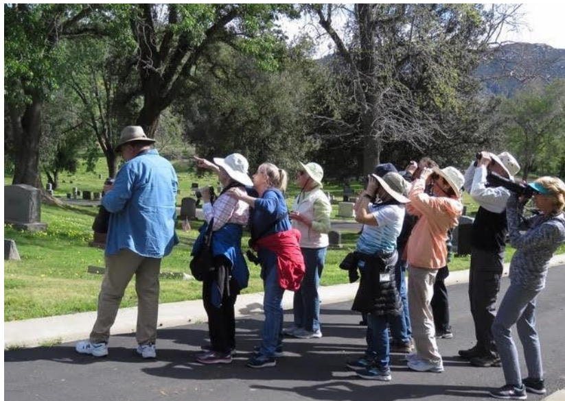
Birding Group - JC