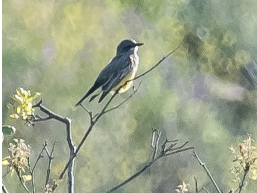
Cassin,'s Kingbird WS