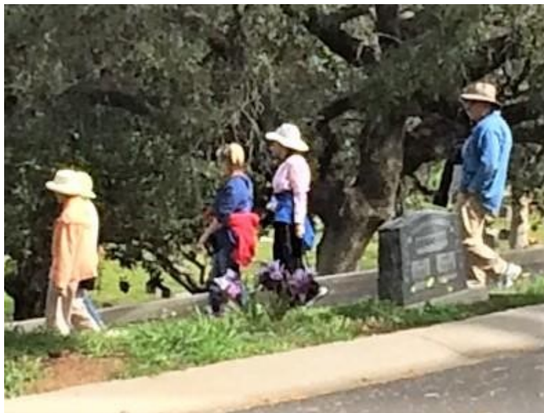
Birders - RB