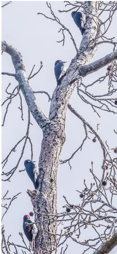
4 Acorn Woodpeckers WS