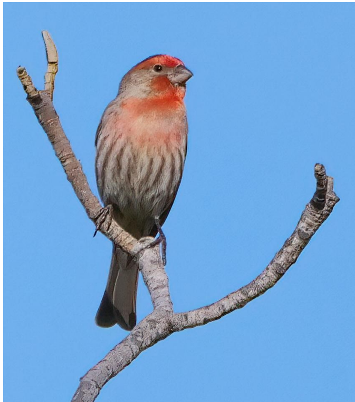
House Finch AB