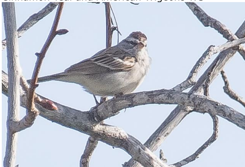
Chipping Sparrow WS