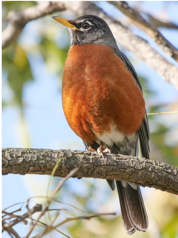
Beautiful shot of American Robin in sunlight AB