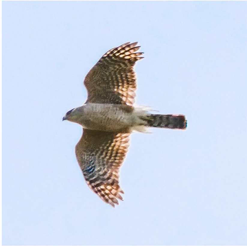
Coopers Hawk AB