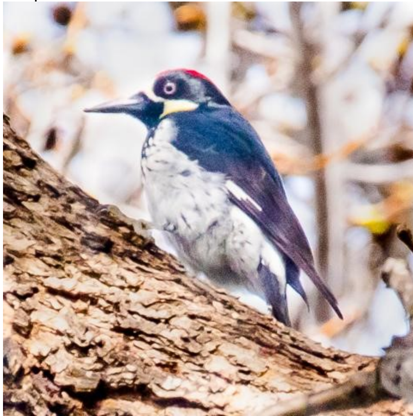
Acorn Woodpecker up close WS