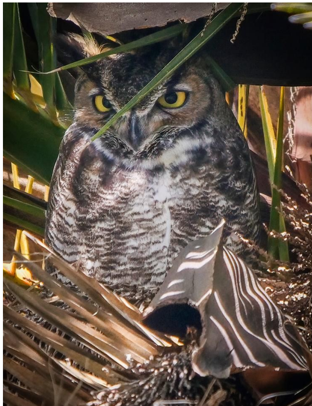
Great Horned Owl Different view AB