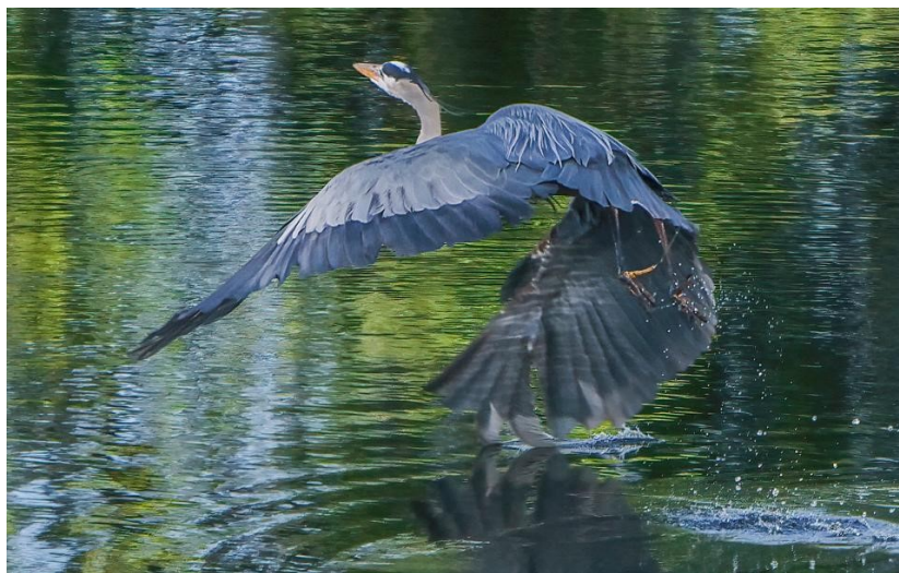
Great blue Heron AB