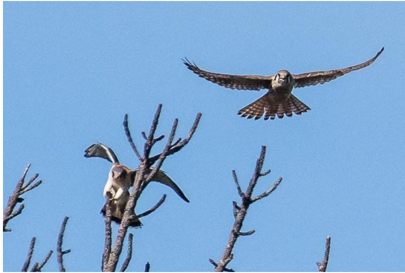
Kestrel's mating dance WS