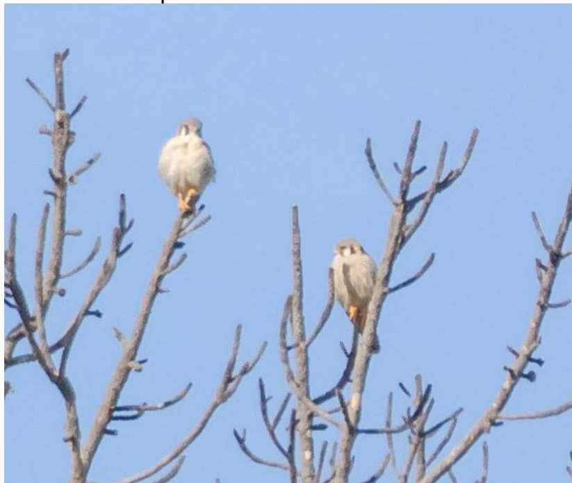
Perched Kestrels MB