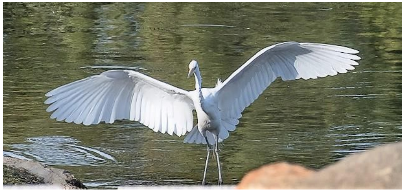
Great Heron landing WS