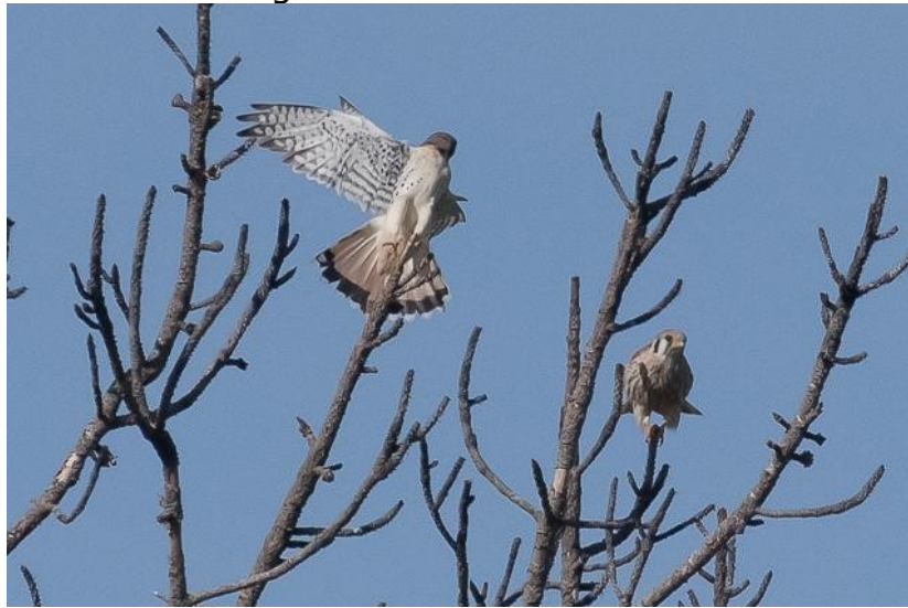
Same Mating Pair of Kestrels WS