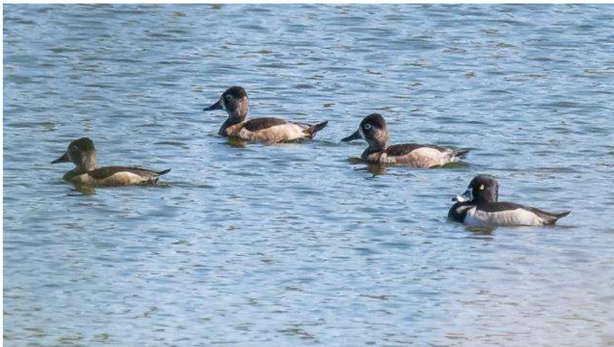
Ring-necked Ducks - Bill saltzman