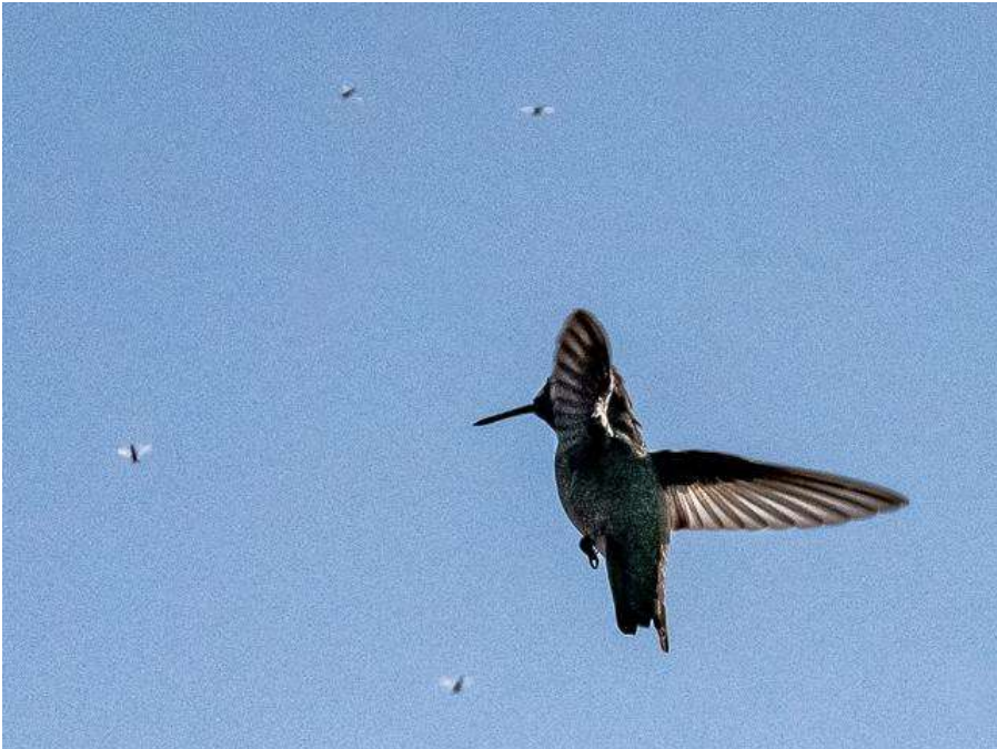
Anna's Hummingbird choosing breakfast. The 4 bugs are almost clearer than the bird Next shot with mouth wide open. Again sorry for the resolution but capturing hummingbirds on the fly is an art to be learned.