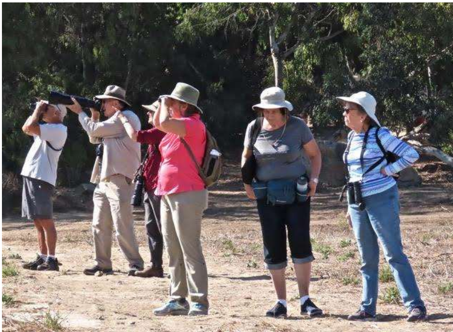
OHCC Birders at Whelan Lake