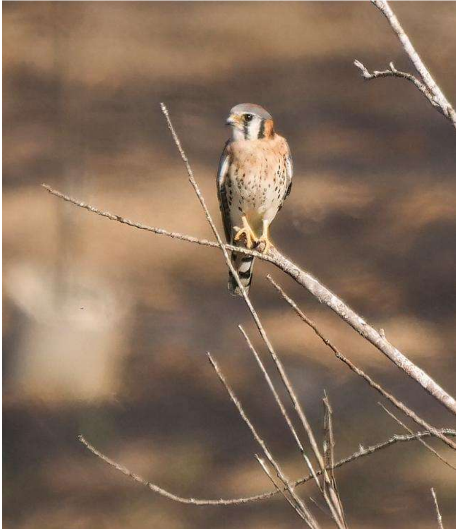
American Kestrel - Smallest American Raptor