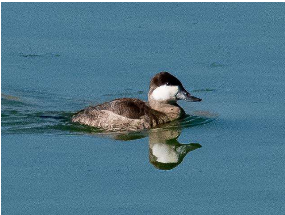
Ruddy Duck