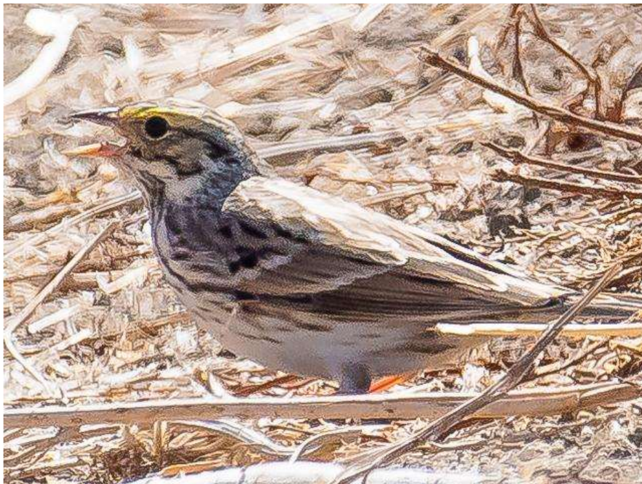
Song Sparrow - Bill Saltzman