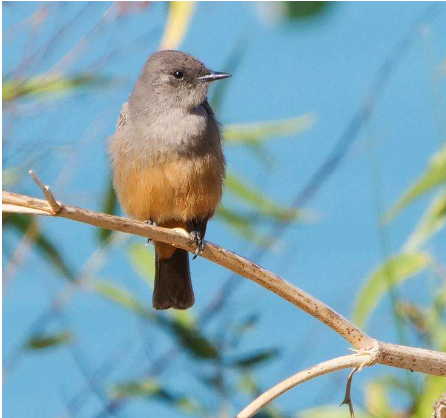
Say's Phoebe