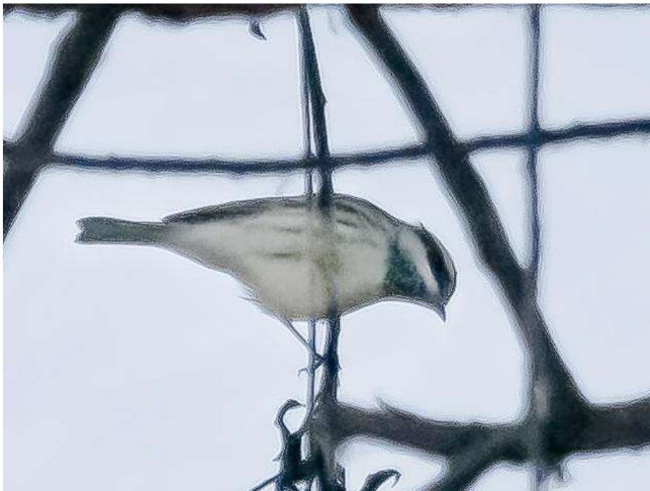
Black-throated Warbler in dense brush - resolution weak but wanted to show. Spotted by Jane Johnson - Bill Saltzman, a first for me.