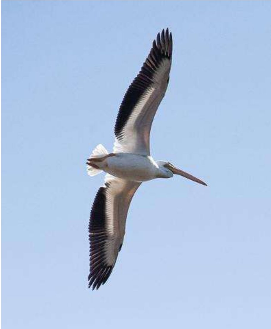
White Pelican with wing structure showing through bright sunlight - Bill Saltzman