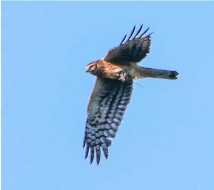
Northern Harrier -not often seen