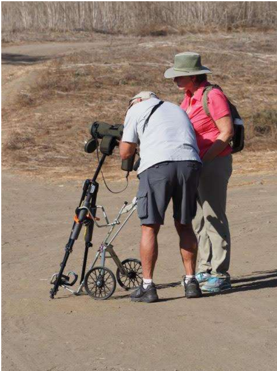
Scope on wheels