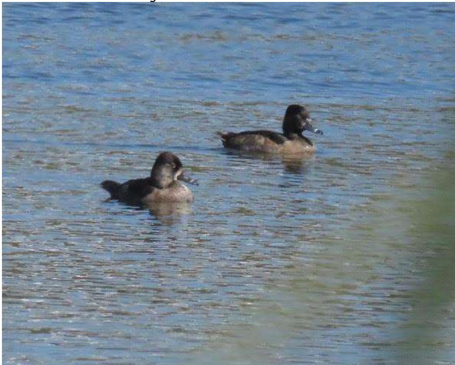
Ring-necked ducks - Joan comito