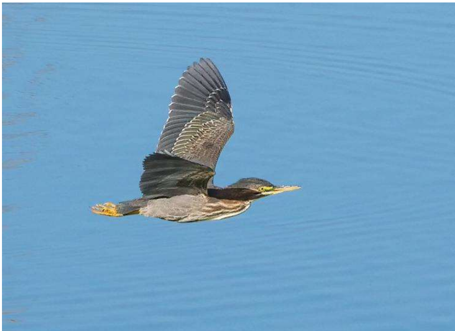
Green Heron - Ann Baldwin - again not often seen.