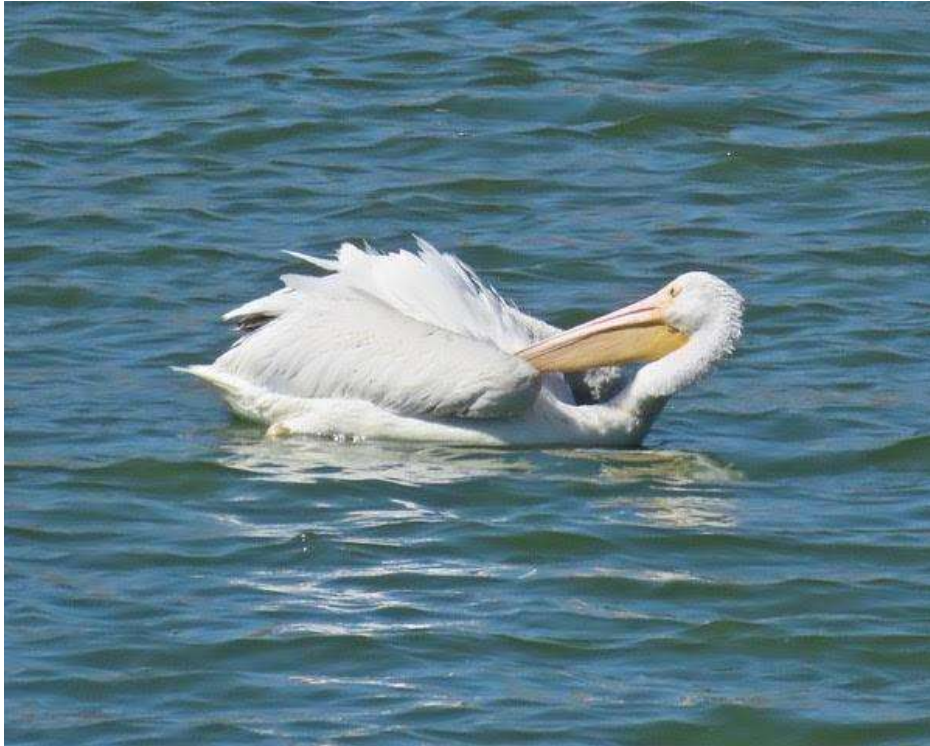
White Pelican Preening