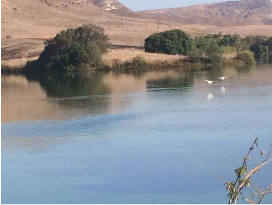
White Pelican's flying across lake