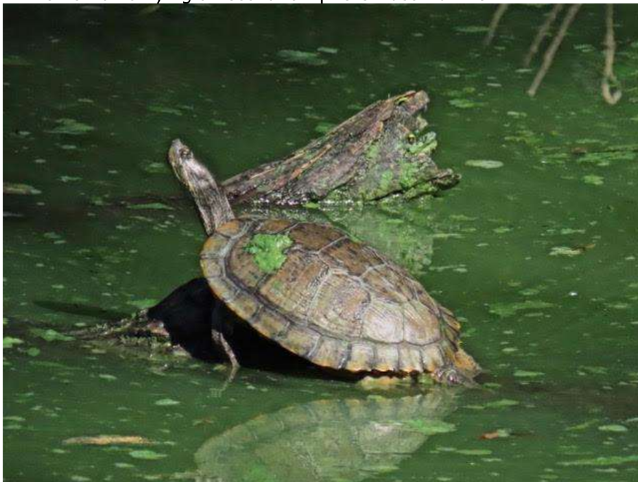
Turtle in pond - Joan Comito