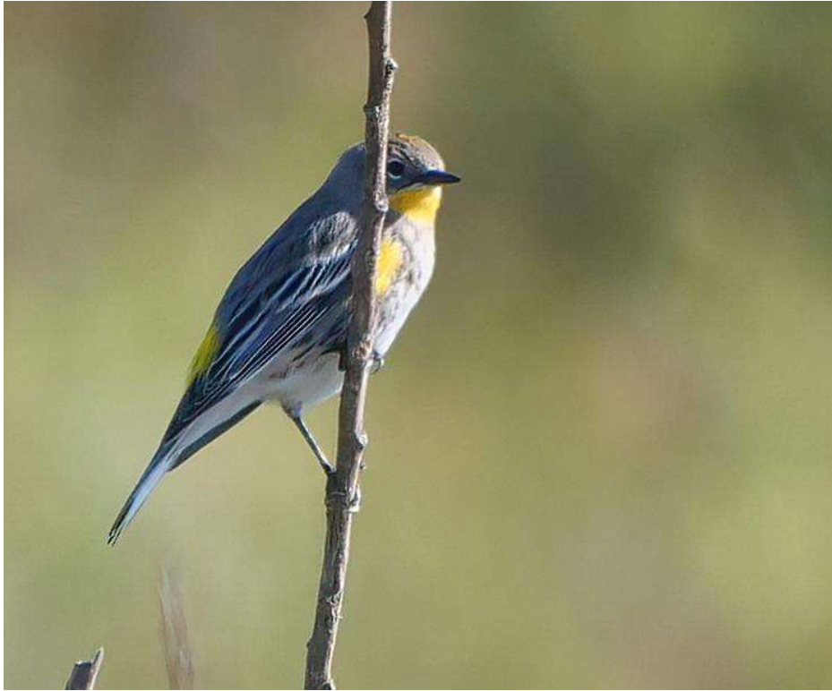
Yellow Rumped Warbler - Ann Baldwin