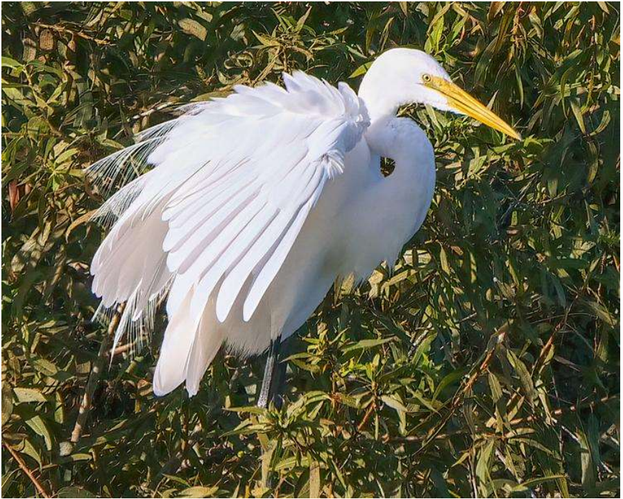
Great Egret - Ann Baldwin